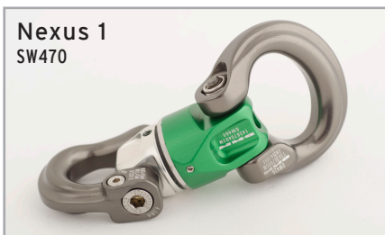
Nexus 1 SW470

Fully retro-fittable, modular system allowing two connections to fixed points, connected with a high performance swivel.