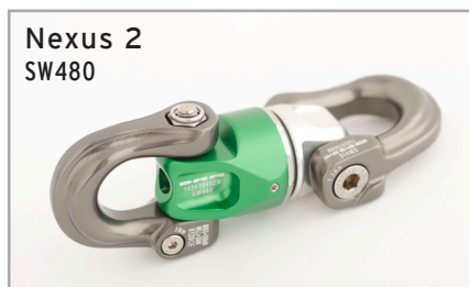
Nexus 2 SW480