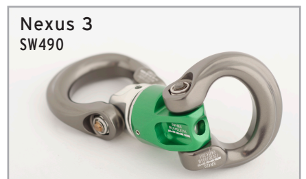
Nexus 3 SW490