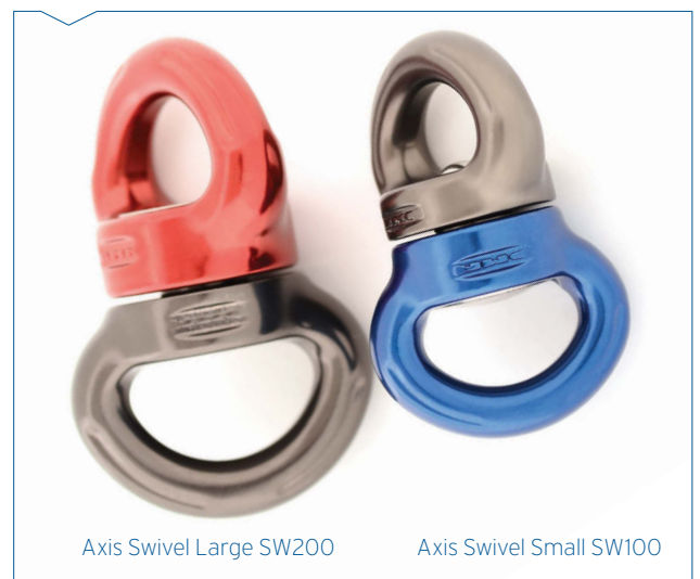
Axis Swivel Large SW200

The smooth bearings, textile friendly surfaces and high strength of the Axis Swivel ensures efficiency within lifting systems. The carefully designed attachment holes offer the possibility of multiple configurations.